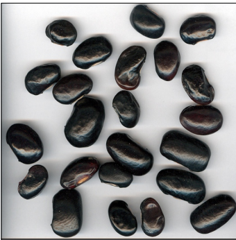
Pralbønne, Phaseolus coccineus , Black coat runner bean FS0553