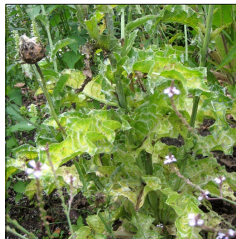
Marietidsel, Silybum marianum , Marietidsel FS0350