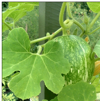
Figenbladsgræskar, Cucurbita ficifolia , Siam FS0480