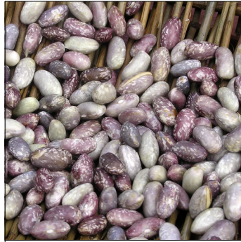
Havebønne, Phaseolus vulgaris , Hundrede for én FS0210