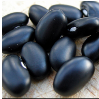
Havebønne, Phaseolus vulgaris , Feijon Preto FS0513