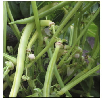
Havebønne, Phaseolus vulgaris , Carmencita NGB1829, FS0425