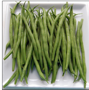
Havebønne, Phaseolus vulgaris , Nerina FS0212