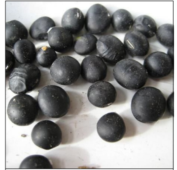
Sojabønne, Glycine max , Kuromame, syn. Hokkaido Black, FS0257