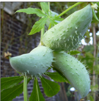
Caihua, Cyclanthera pedata , Caihua, syn. Achocha, Korila