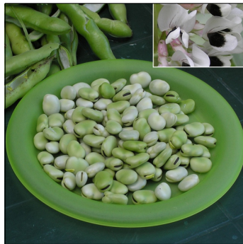
Valsk bønne, Vicia fava , Bobs Fava FS0248