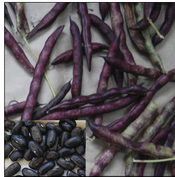
Havebønne, Phaseolus vulgaris , Cherokee Trail of Tears