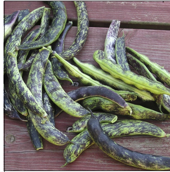
Havebønne, Phaseolus vulgaris , Kjems pea bean FS0206