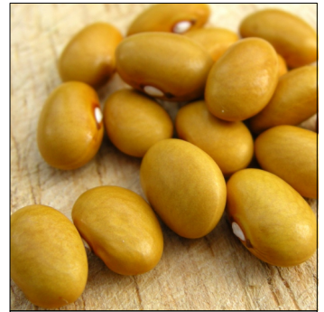
Havebønne, Phaseolus vulgaris , Prinsesse fra Mariager NGB20128, FS0196