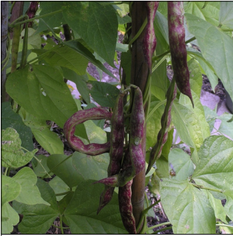
Havebønne, Phaseolus vulgaris , Stangbønne Borlotto-type (Foto: IJ) FS0201