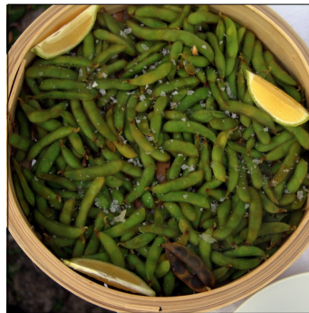
Sojabønne, Glycine max , Fiskeby V Holschers Frøhandel (Foto: MJ), FS0256