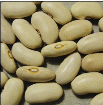
Havebønne, Phaseolus vulgaris , Turda fra Seed Ambassadors