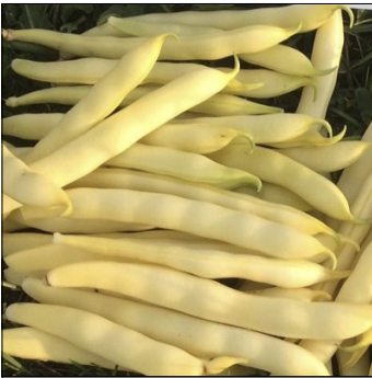
Havebønne, Phaseolus vulgaris , Mont d'or FS0573