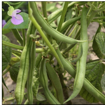
Havebønne, Phaseolus vulgaris , Carlos Favorit FS0208